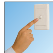
Wall Switch With 240V Electric Motor*