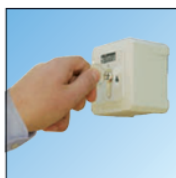
Key Switch With 240V Electric Motor*