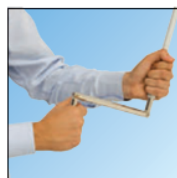
Crank Handle With 240V Electric Manual Override Motor