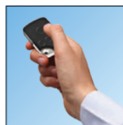
Remote Control (Key Ring Transmitter) With 240V Electric Motor & Multi-Function SIMU SD100 Hz Radio Receiver & Control Unit*

* Control options must be installed in an indoor environment.