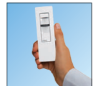
Remote Control With 240V Electric SIMU Hz Motor*