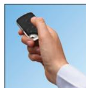
Remote Control (Key Ring Transmitter) With 240V Electric Motor & Multi-Function SIMU SD100 Hz Radio Receiver & Control Unit*

* Control options must be installed in an indoor environment.