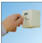
Key Switch With 240V Electric Motor*