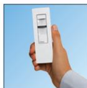
Remote Control With 240V Electric SIMU Hz Motor*