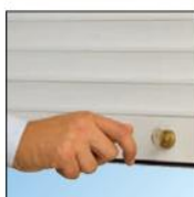
Spring Loaded With Key Lock (Up To 3.2m Wide)