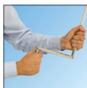
Crank Handle With Gear Ace (Up To 30Kg)