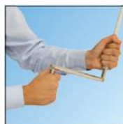
Crank Handle With 240V Electric Manual Override Motor