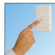
Wall Switch With 240V Electric Motor*